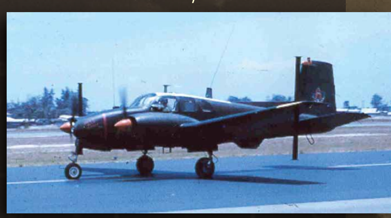
U.S. Army RU-8 ARDF