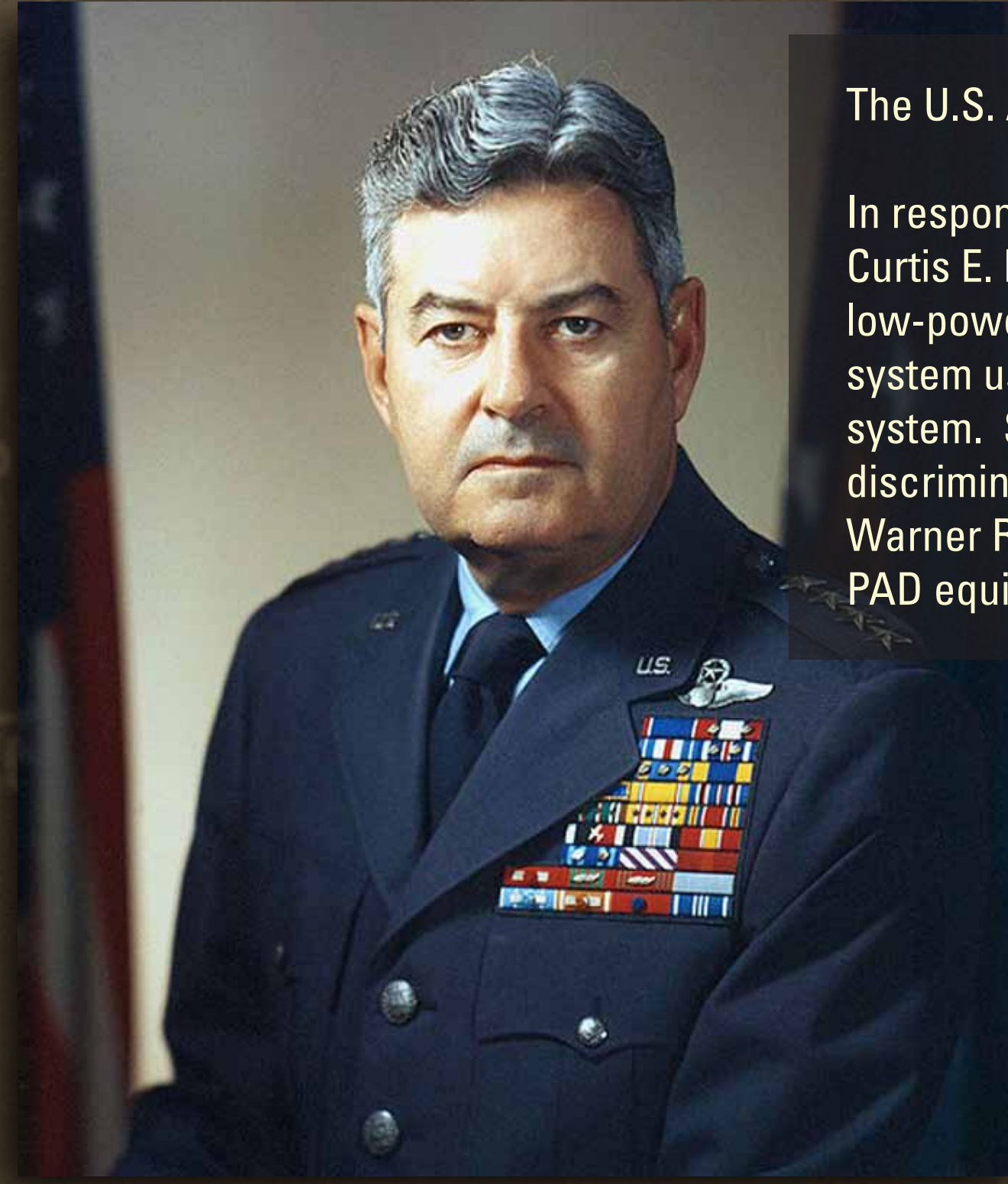
The U.S. Air Force and ARDF

In response to the increased tasking for Army ARDF coverage, Air Force Chief of Staff General Curtis E. LeMay was determined to get the USAF involved in this airborne mission to locate enemy low-powered tactical radio transmitters. In April 1962, LeMay ordered development of an ARDF system using the electronic principles of the VHF omni directional radio range (VOR) air navigation system. Sanders Associates of Nashua, New Hampshire, was selected to design a "phase angle discrimination" (PAD) high frequency direction finder for the C-47D aircraft. On September 26, 1962, Warner Robbins Air Material Area began modifying a C-47D, tail number 45-0925, with the Sanders PAD equipment. This was named project HAWKEYE.