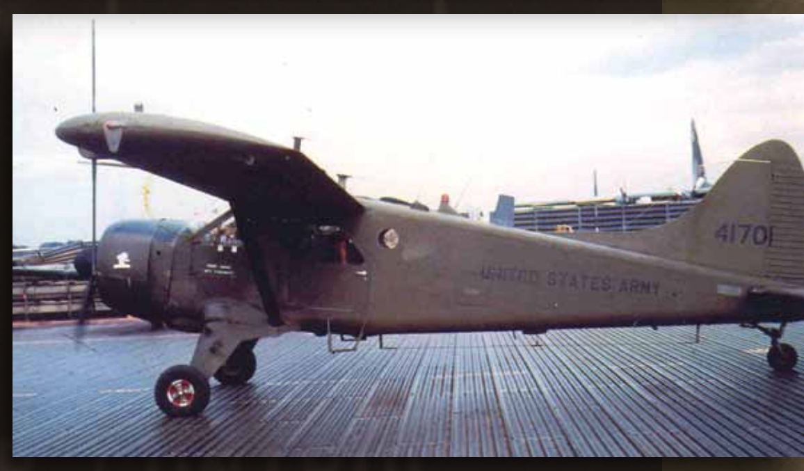
U.S. Army U-6 ARDF

The Army Security Agency (ASA) fielded the first tactical ARDF systems in Vietnam with the U-6 Beaver and RU-8 Seminole aircraft using an airborne "aural null" technique for homing in on enemy radio transmitters