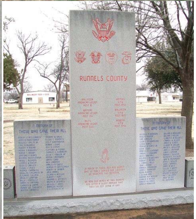
PARADE, from Page 1

The parade will include fire trucks, Goodfellow AFB marching troops and color guard, old cars, trucks, trailers, 4-wheelers, horses and jeeps. Anyone who wants to participate, contact Sandra at 365-3612.